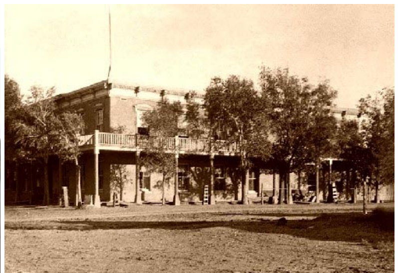
Historic View of St. Jame Hotel in the 1800's from vintage Postcard (Website address available for prints)