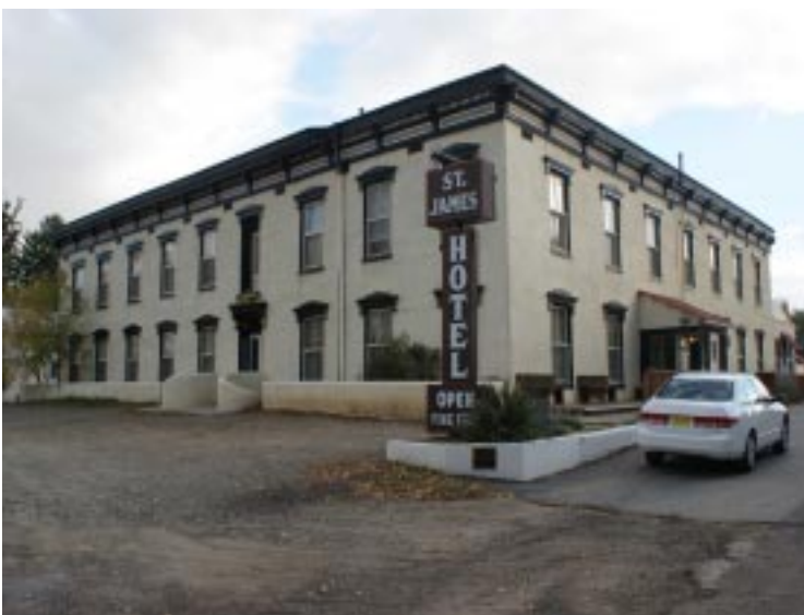
St. James Hotel