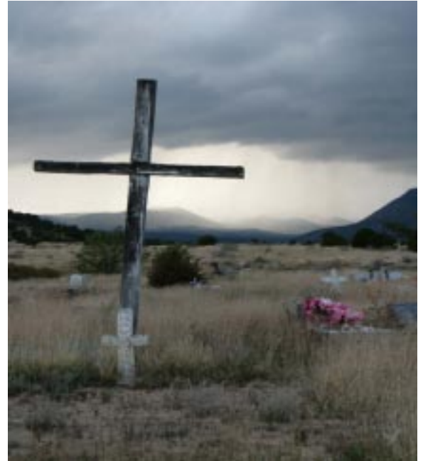
Grave Yard, Cimarron Valley